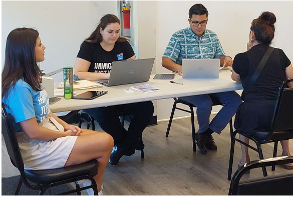
TLC staff and volunteers (Spanish-speaking) assist Maui fire survivors with U.S. Citizenship & Immigration Services applications for replacement documents.