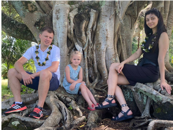
Ukrainian family that came to TLC for help with green card applications.