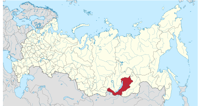
Buryatia region in red

Our client, a highly educated citizen of the Russian Federation from Siberia's Buryatia region, found himself at a crossroads. He had to make the difficult decision to leave Russia due to concerns for his safety, primarily stemming from his vocal criticism of the Russian government's policies. His decision was made after a peaceful picket protest against the Russian government's war in Ukraine, which led to his detainment by Russian authorities.